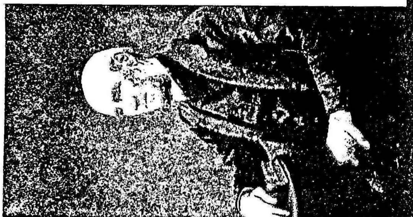
Believed to be a copy of that photograph