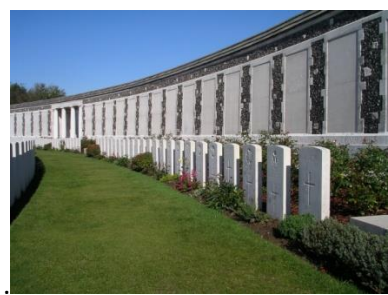
Tyne Cot Memorial Panels