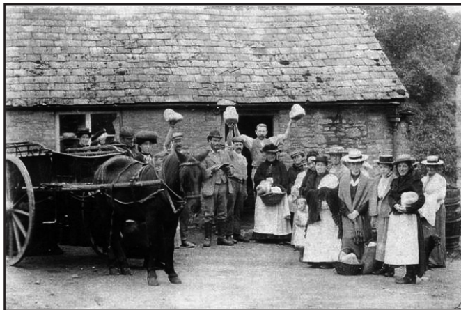
Constable's bakery in South Street, Middle Barton c.1910